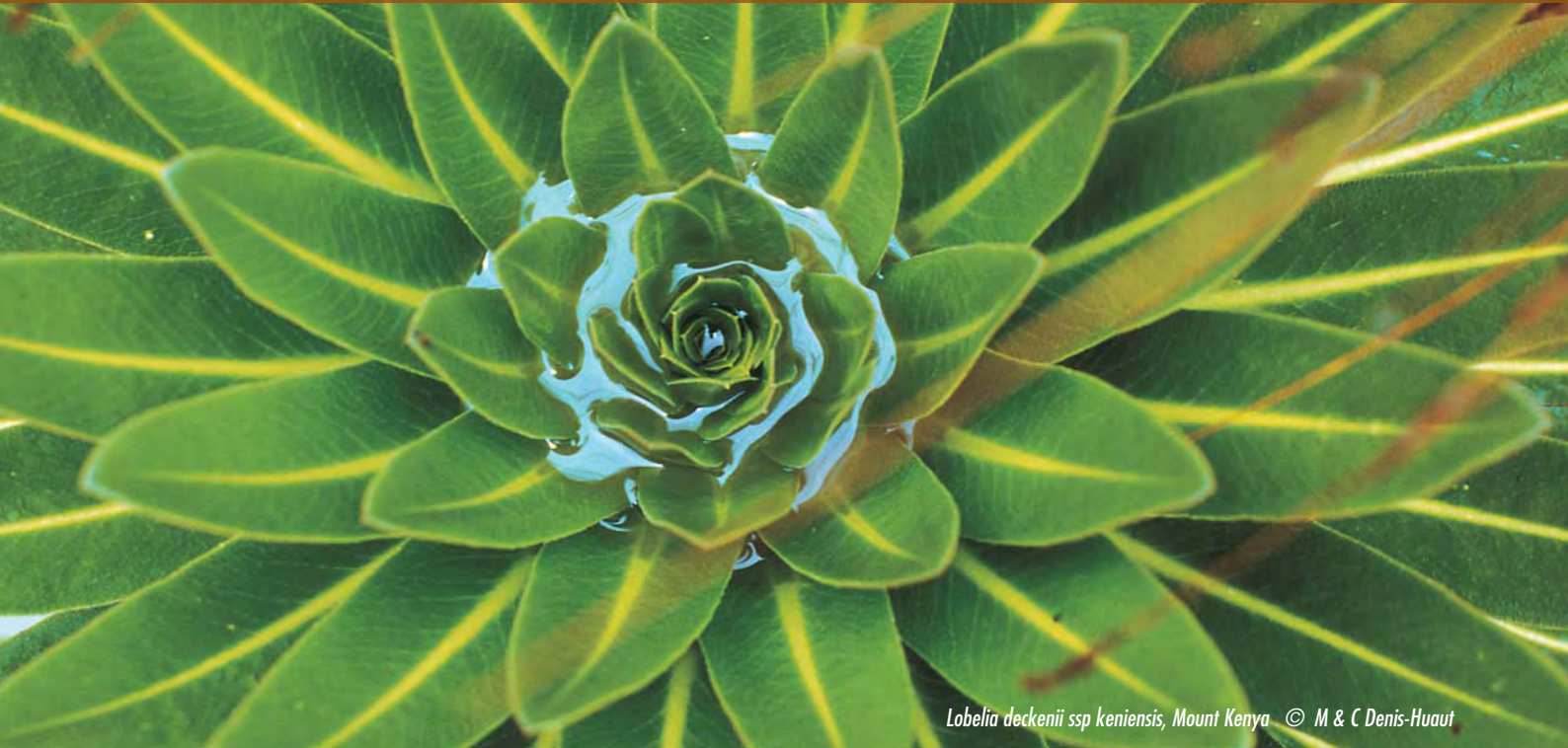
Lobelia deckenii ssp keniensis, Mount Kenya