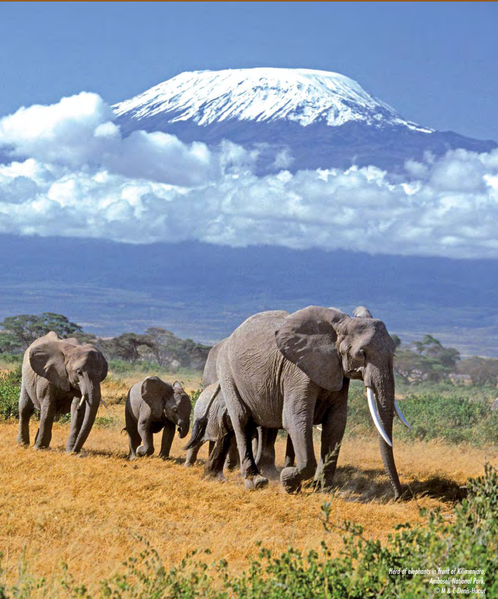
Herd of elephants in front of Kilimanjaro, Amboseli National Park.